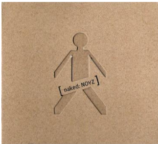
Noyz 2007. Multikultivator (Serbia) Naked noyz - experimenting with many different sounds, musical rules and rhythms.